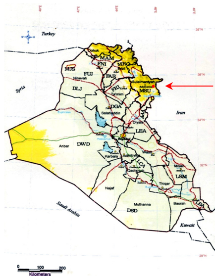
Figure 1. A map of Iraq showing with regions and districts; • The red dot indicates the location of U. tropeolifolius subsp. zalamica

Perennial, succulent herb, (21-30) cm, glabrous, stem erect, unbranched, green. Basal leaves peltate, petiolate, margin crenate, blade diameter of 2.5-3.3 cm, petiole terete, (7.0-9.3)×(0.2-0.4) cm. Lower cauline leaves orbicular, petiolate, margin sinuate, blade diameter of 2.2-2.7 cm, petiole terete, (6-8) × (0.15-0.25) cm, Upper cauline leaves peltate, petiolate, margin sinuate, blade diameter of 1.8-2.3 cm, petiole terete, (3.0-5.0)×(0.1-0.15) cm. Inflorescence a compound raceme, peduncle light green, (7-9)×(0.10-0.20) cm. Flowers hermaphrodite, pedicel (4.5-6.0)×(0.4-0.7) mm. Sepals 5, connate at the base, narrowly ovate, light green, (1.8-2.3)×(0.8-1.2) mm. Corolla obconical, light yellow, with white dots, consist of a tube and a limb with 5 equal lobes, lobes apex acute, limb (2.2-2.5)×(1.2-1.5) mm, the tube (3.5-4.0)×(2.6-3.0) mm. Stamens 10, epipetalous, 5 of them antipetalous and the others antiseptalous, filaments