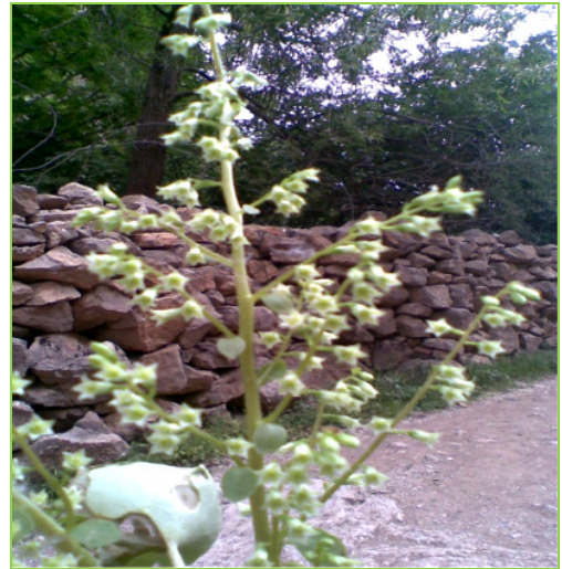
Figure 2. Field photograph of U. tropaeolifolius subsp. zalamica

filiform, light yellow, (1.0-2.0)×(0.10-0.15) mm, anthers spherical-semi spherical, yellow, basifixed with the filaments, (0.3-0.4) × (0.35-0.45) mm. Pistils 5, united at the base, ovary superior, with white dots, unilocular, multi-ovules, narrowly lanceolate or narrowly ovoid, light yellow, (3.5-4.4)×(0.7-1.8) mm, style terete, terminal attachment with the ovary, light yellow, (0.30-0.45 ×(0.2-0.25) mm, stigma spherical, light yellow, (0.15-0.25)×(0.12-0.20) mm. 5 equal nectar glands at the base of the ovaries (from the outer side), oblong or narrowly oblong, green with red dots, apex slightly concave, (0.5-1.0)×(0.30-0.45) mm. Fruit an aggregate follicles, dehiscent, follicles like ovaries in the shape, brown, (4.2-5.0)×(1.0-1.2) mm. Seeds numerous, narrowly oblong or narrowly obovoid, dark brown, (0.3-0.5)×(0.12-0.20) mm. MSU: ESUH/ Zalam region (South East of Sulaimaniya), 800 m, 20. 4. 2017. Grow as individuals in the region, on rocky clay soils; flowering: April (Figures 2 and 3).