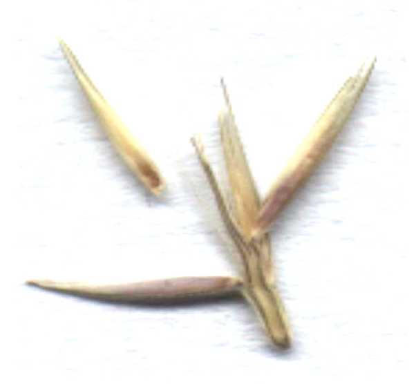
Figure 3. Detail spikelet (original scaned)