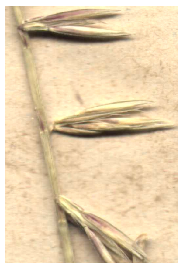
Figure 2. Detail inflorescences (original scaned)

We do not know the ways this species appeared in this area and, moreover, nobody has collected it since 1962 to the present. It may have been accidentally introduced in our country, together with the import of